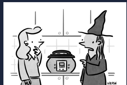
"It's one of those new Instant Cauldrons. You put a kid in here with some eye of newt and an hour later it's the best thing you've ever eaten."

Get your FREE Cyber Tip of the Week at: denbeconsulting.com/cyber-security-tip-of-the-week/