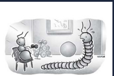
"Man I hate leg day."